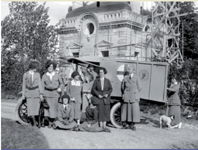
American volunteers